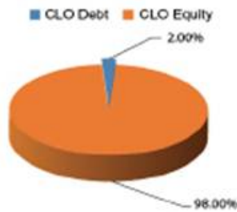
FAIR VALUE BY ASSET TYPE